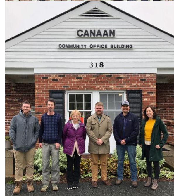
Photos: Top-Reading Energy Board Energy Fair funded by mini grant. Bottom-Canaan Town Office Assessment